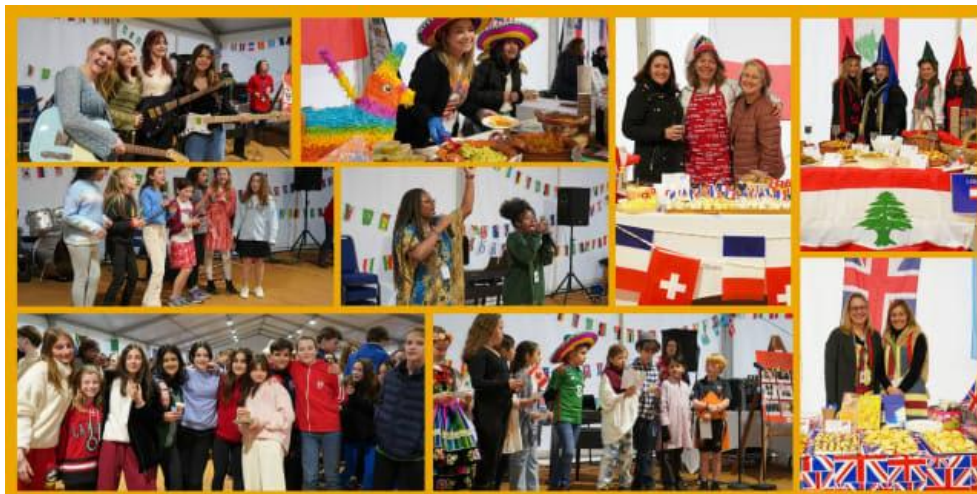
TASIS England International Festival 2023

We would love to see you at these unique celebrations if you are able to join us as part of a school visit. Our 2024 International Festival will take place on April 26 (3:30 - 5:30 p.m.) and Mayfair will take place on May 11, 2024 (11 a.m. - 3 p.m.)