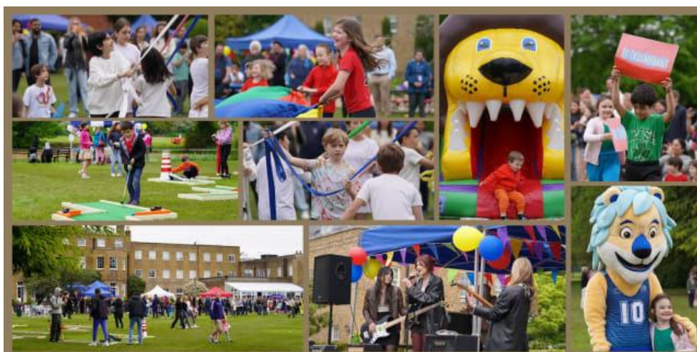
TASIS England Mayfair 2023